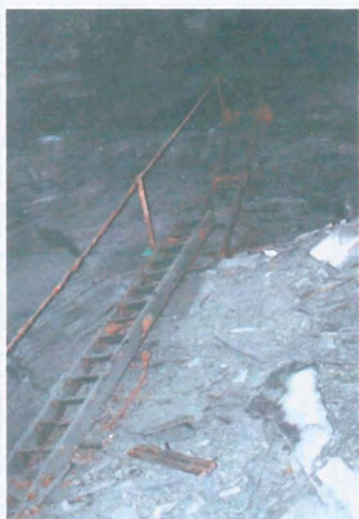
Timber Ladder way from Floor H to Floor G.