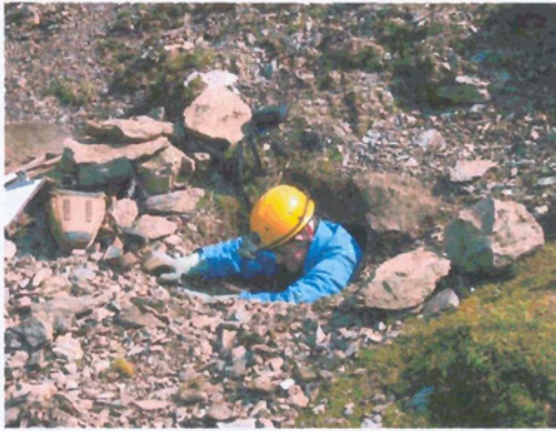
Goldscope Coffin Level entrance, 24.4.05