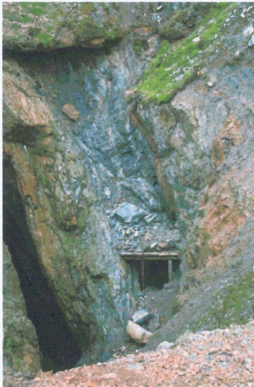
Levers Water Mine entrance