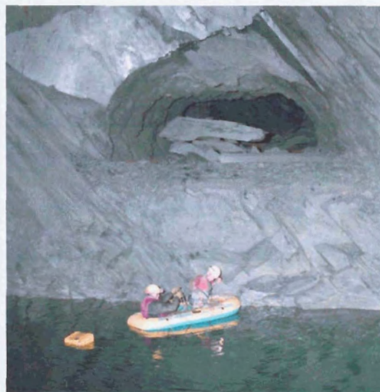
Mark Waite prepares to land

Initially the working face of the chamber was explored and whilst a level was found this did not get into any significant ground. Boating further along the side of the chamber we were able to use Ashby's pitons (at last!) to hold the boat steady enough for Mark to drill and install a series of bolts, giving access to the level above. At this juncture a series of ropes were rigged to enable the boat to be pulled back across the chamber so that the remainder of the group could make the journey. When you are in a small cheap boat in a flooded chamber at least 50' deep, and are 400' below the surface and almost a mile horizontally from where you entered the mine, you realise that you need to pay attention since you are a long way from any external help.