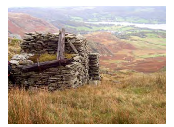
Pylon No 8, looking down the flight.

We were fortunate with the weather. Saturday was a washout, and Sunday was forecast to do the same. However the mist cleared and the rain stopped shortly after we arrived, so we had a window of fair weather. Alastair and Maureen went off to do their own thing and the rest of us struggled up the exceedingly steep fellside. The cable was supported by wooden pylons on stone bases, and most of these remain, as does the cable and various artefacts. We photographed each one and plotted a ten figure OS grid reference, using GPS