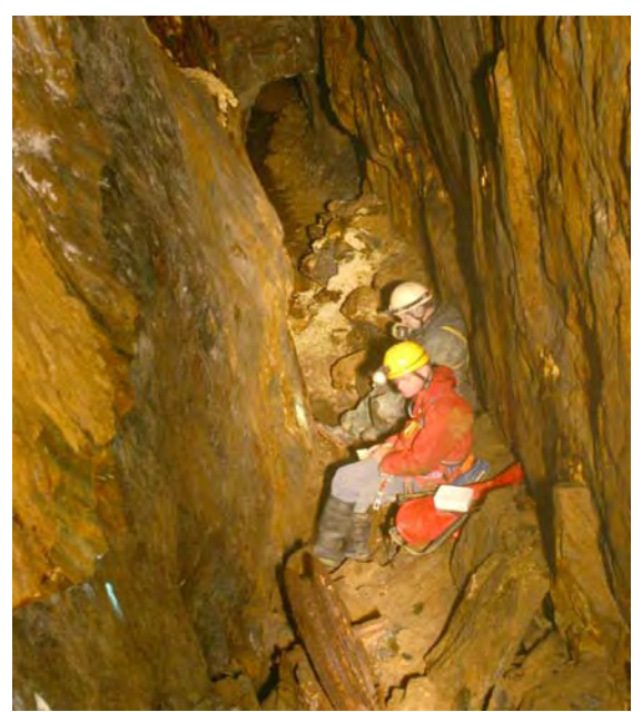
Lunch by the New Engine Shaft

From here on the ML and Chairman's memories seemed to improve quite well and good progress was made on to Triddle shaft visiting the Blue Pool en route.