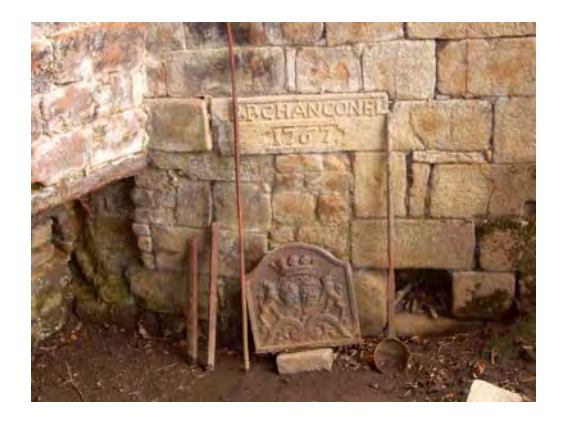
Moulded objects, fire backs, cooking pots etc. were produced.

furnace, the forges, the charcoal barn, the fendery and the miners chapel. The first written mention is an acte notarié of 22^{nd} June 1586, but the neighbouring forge at Halouze was created in 1530.