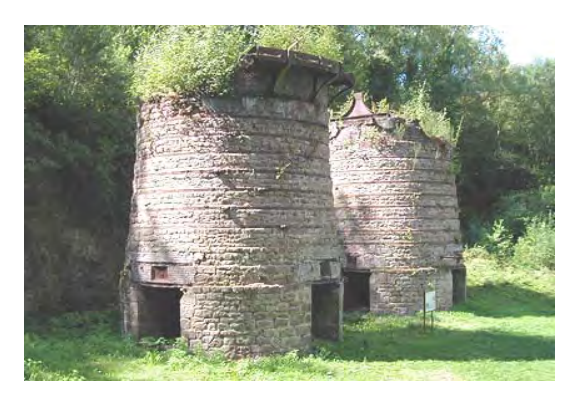
These two buildings are the survivors of a battery of 8 furnaces built in 1901, which were the first calcination kilns established in a mining site of Basse-Normandie.

In the sixteenth century a number of water powered forges were in existence and in 1750 a blast furnace similar to that at Newland was in operation at Varenne. In the middle of the 19th century the artisanal forging mills disappeared little by little to make way at the beginning of the 20th industrial century with centres. Those disappeared in their turn from the year 1960; the last mine ceased its activity in 1989.