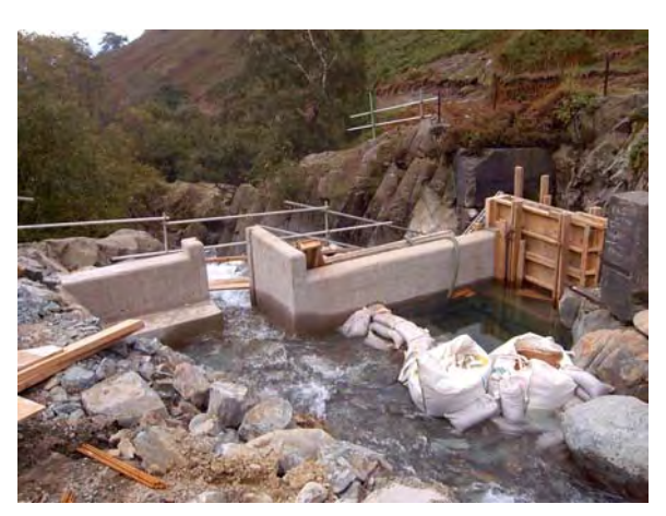
Construction of the new dam at the top of Church Beck Gorge.

put a tax on using 'their' water, & this made many of these small units unprofitable. Now of course they want them back, but the pipelines often cross numerous people's land making negations tedious & reinstatement difficult. Governments can usually be relied on to produce the best shortsighted decisions. Dave Sewart.