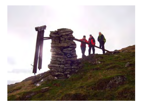
Pylon No 7. The wooden pylon has slipped off its base, but is still supported by its braces.