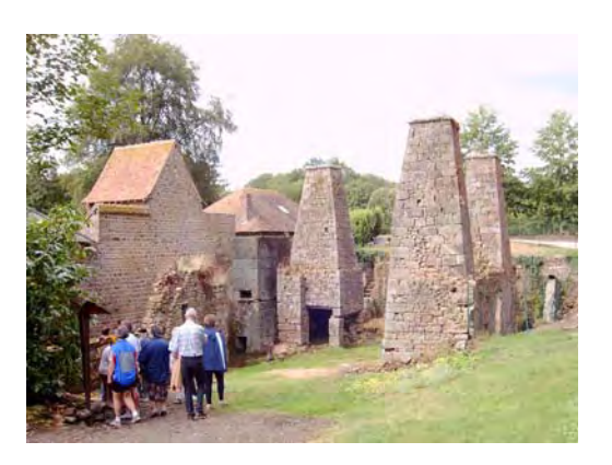
Finery: The cast iron was transformed to wrought iron in the three forges. The 16<sup>th</sup> century chimneys of the forges are remarkable in Europe.