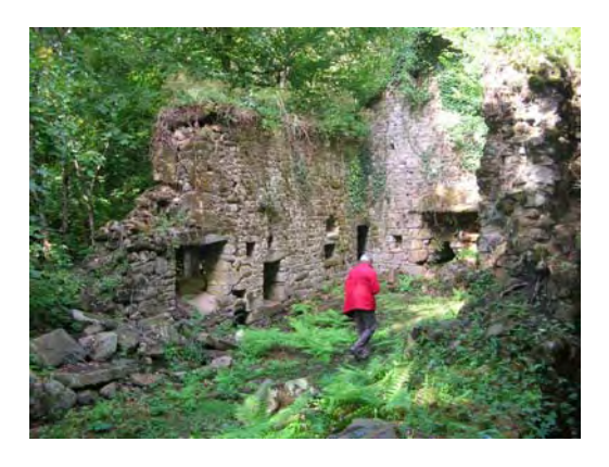
Fenderie: This rolling mill was recorded in an inventory of 1614. It is the only 16<sup>th</sup> century fendery in Europe with two reverbatory furnaces

The entire complex, though buried in the forest, is intact, including the system of leats and ponds drawn from the river Varenne. In summer one can get a three hour guided tour.(in French) The complex closed down, I think, in 1895. Apart from a century of disuse, the only changes are that a chateau was then built nearby, and more recently the charcoal barn has been converted to residential accommodation.